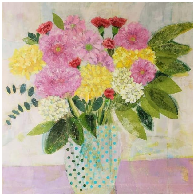
Summer Bouquet by Stacy Yochum