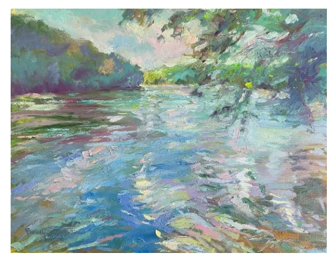
3rd Place: Potomac Haven by Holly Buehler