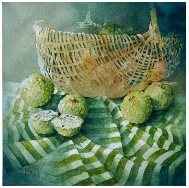
2nd Place: Sugar Apple Harvest by Cecile Kirkpatrick