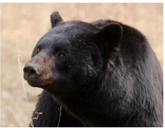
She will have three pieces in the show-"Wild Dolphin Strand Fishing," "Bear-Yellowstone National Park," and "Osprey Nest in the Tall Pines."