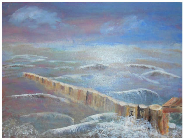
As the Storm Recedes Penny Kritt Acrylic on Canvas

In As the Storm Recedes below, I used a color strategy instead of props to give to imply that there's still plenty of time to set up the grill on the beach for the party tonight!