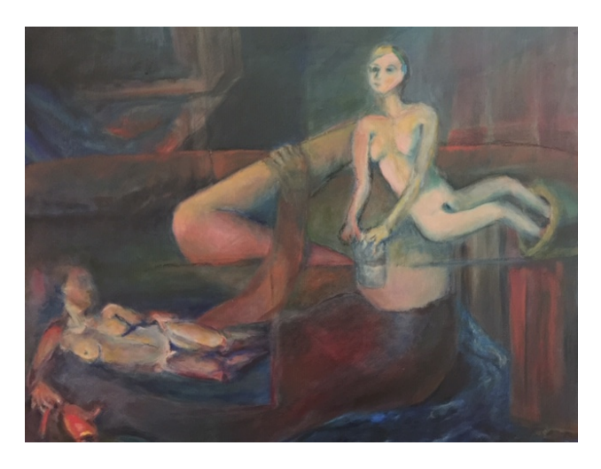
"Wuhan Virus," by Sharon Wine Virus emerging from test tube. Purposely allowed to spread. Swirling water. Attempted resistance. Not successful. Chaos. Overturned jug economic consequences.