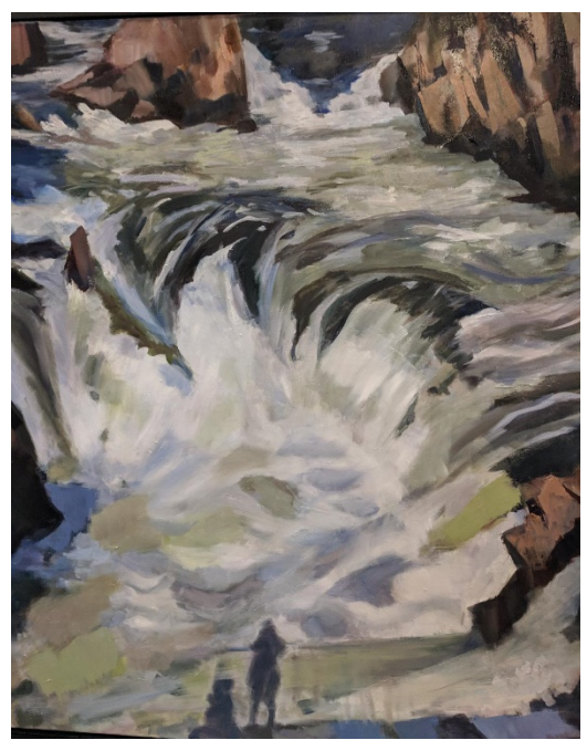
A "Wow" Moment by Sabiha Iqbal Oil on Canvas

Sabiha really got the essence of both water and rocks without adding fussy details. Her water has lots of soft edges between color shapes and