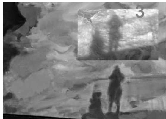
Inset 3 (black and white)

even softer as seen in the photo. That's part of why the figures in the painting look like people standing up (vertical) versus shadows cast on a horizontal surface.