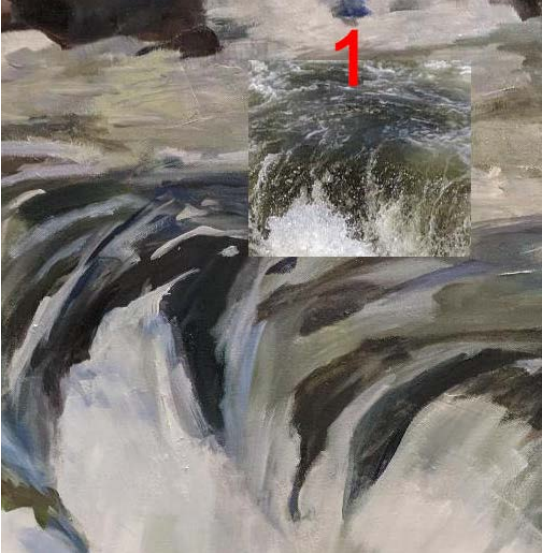
Inset Detail 1