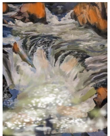
A Wow Moment (with suggested modifications)

using horizontal brush strokes with very soft edges.