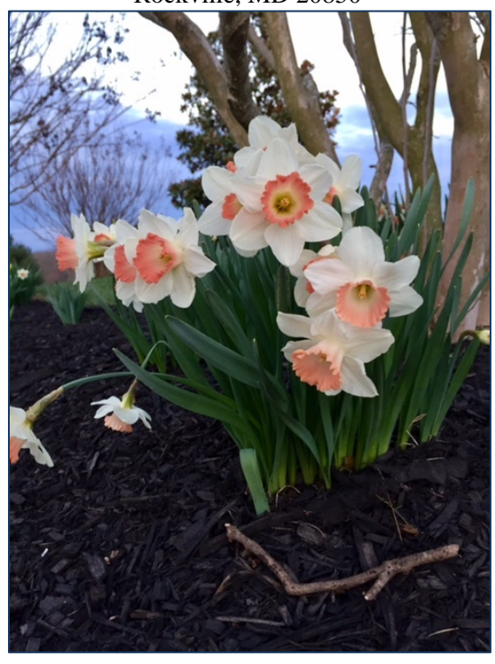
Rockville Art League P.O. Box 4026 Rockville, MD 20850