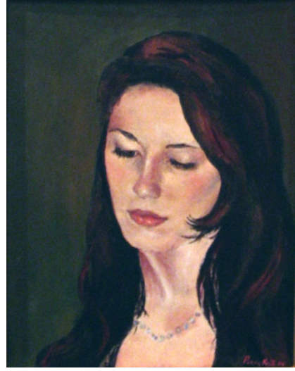
McKenzie By Penny Kritt Acrylic on canvas

While adding light – and the darker shadows associated with it – usually makes a composition more interesting, that's not always true. Because of the model's contemplative expression, a more somber background suits it best.