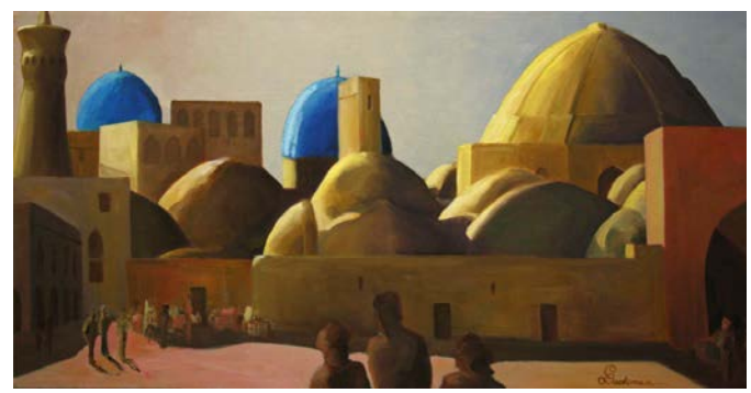
"From the Corners of the Earth"