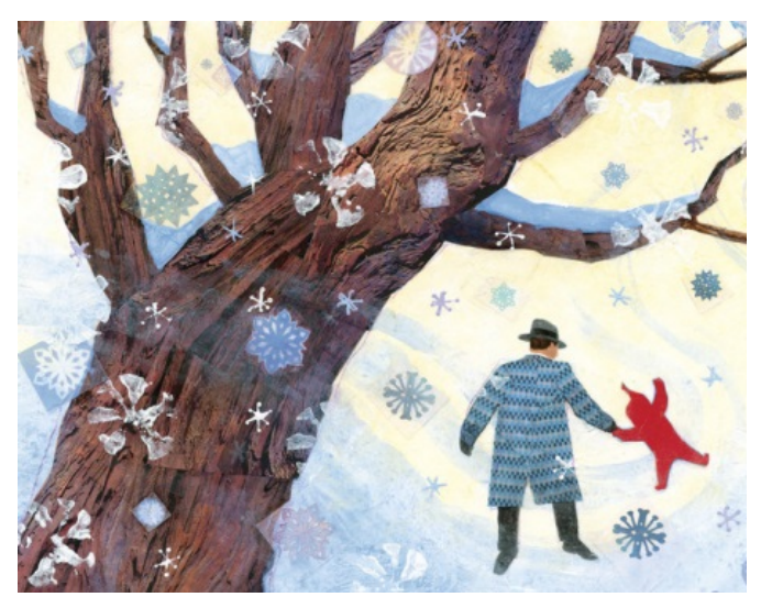
Call for Entries for Glen View Mansion 2018

The City of Rockville celebrates its commitment to the arts through programs that reflect the diversity and vitality of the community. It is with great pride that the Glenview Mansion Art Gallery continues to showcase the finest artists in the region.