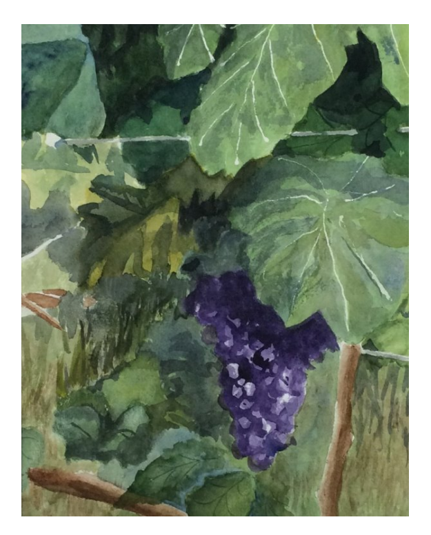
Before It's Wine Watercolor By Rob Gale

There's a lot to like about this piece. The composition is strong, and no shapes need to be changed. There's a nice variety of vertical grass and curvilinear leaf shapes that contrast with the horizontal wires and diagonal wooden stakes that peak in and out. Rob's done a good job of contrasting warm and cool greens, and that adds a feeling a sunlight. By having leaves and other shapes fall outside the painting, he added a sense of lush greenery. Leaves overlap the fence wire, the wooden support stakes and the grapes, so there's a feeling of depth and a hint of what hides in the shadows.