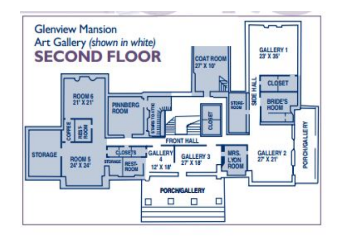
APPLICATION DEADLINE: 5 PM, Friday, April 21, 2017

CV or Resume of individual artist(s) or group applying for consideration.