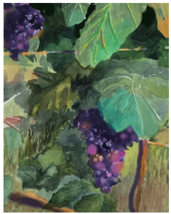
Before It's Wine (enhanced version)

Some shadows are darker. The one between the two leaves at the top center is much darker. See how things look more three dimensional? The upper grapes are also dropping out of a dark shadow. Now the painting has more depth.