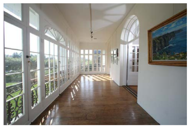
RAL Juried Member Art Show Glenview Mansion