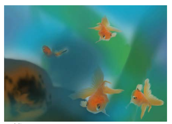
Goldies No. 1 Digital Art By Penny Kritt

effect of depth under water. The little fish on the left is clearly deeper underwater than the others, and perhaps she's just swum up from the hole that's just beneath her. The fish in the lower middle is higher and just breaking through the surface of the water. The other two fish are at lower depths.