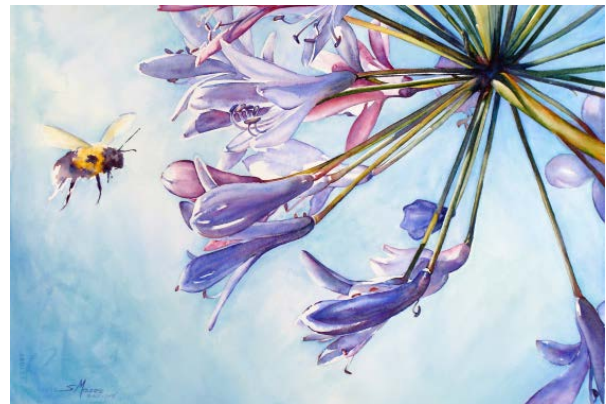
Agapanthus & Bee by Sue Moses

Opening February 22, and continuing through March 27, Sue Moses will have a joint exhibit, "A Natural Perspective," together with Carol Kent at Brookside Gardens Visitor Center , located at 1800 Glenallan Ave, Wheaton, MD 20902. The show, which is located in the Atrium, includes the exhibition and sale of original watercolors. Viewing hours are daily from 9am – 5 pm. Phone – 301-962-1400.