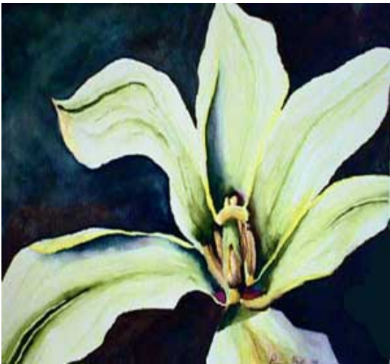
Figure 2 Dying Tulip (11 x 14 in.) Watercolor on Paper By Penny Krit

In Figure 2 above, we're back to flat watercolor, but now there is a portrait of a dying flower. The flower makes such a strong statement that it cannot fit within the borders of the paper. The background is cold and dark to foreshadow what is to come. But this is not a bleak portrayal. The petals still glow with color and the unexpected splashes of burgundy above the petal at the middle bottom prove the old gal ain't dead yet. As with the sunflower above, a few well-placed splashes of red make all the difference.