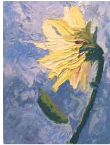
Figure 1 Sunflower Glory (8 x 10 in.) Oil on Canvas By Penny Kritt

There's nothing wrong with a traditional treatment of a single flower floating on a plain background. Unfortunately, this kind of composition is trite, so try something, anything , to make it a little different than all those other single flower paintings. In Figure 1 below, here's an example where texture saved the day. Had this been done with any flat paint like watercolor or oils or acrylics that were thinned down, it would have gotten barely a glance from the viewer.