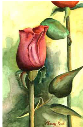
Figure 3 Roses of Antrim (6 x 8 in.) Watercolor By Penny Krit

In Figure 3 below, there's a different technique at work. There is a second flower in this composition, but neither one is shown in full length. Note that the large rose overlaps the leaf of the flower further back. Likewise, the front rose's leaf is clearly in front of the stem of the back rose and that gives the painting a sense of depth. Had I painted two roses side by side, the viewer could have taken in everything in one glance.