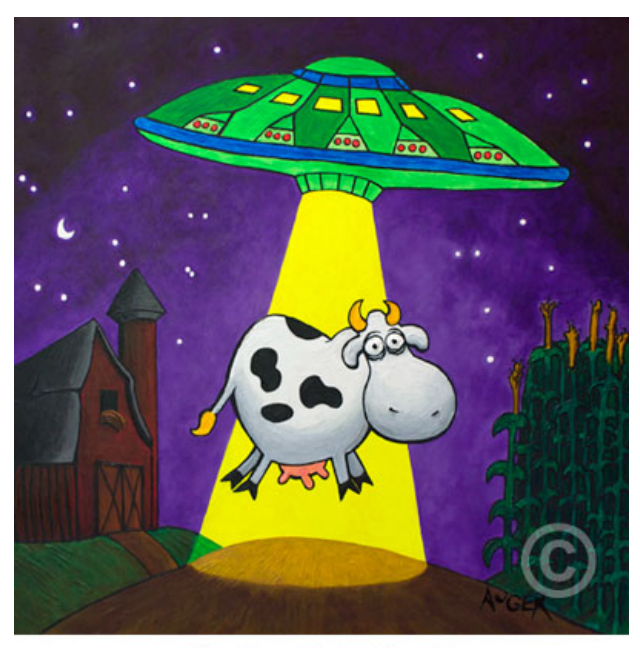
Bovine Abduction II

Hallway. Brookside Gardens has undergone an extensive remodeling of the parking and surrounding area of the Visitor's Center. It is even more beautiful! The address is 1800 Glenallan Avenue, Wheaton, Maryland. The Visitor's Center hours are 9:00 a.m. - 5:00 p.m. (301) 962-1400.