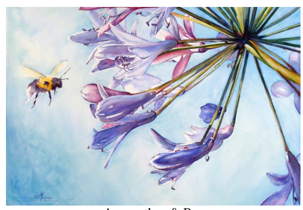
Agapanthus & Bee

Opening February 22, and continuing through March 27, Sue Moses will have a joint exhibit, "A Natural Perspective," together with Carol Kent at Brookside Gardens Visitor Center , located at 1800 Glenallan Ave, Wheaton, MD 20902. The show, which is located in the Atrium, includes the exhibition and sale of original watercolors. Viewing hours are daily from 9am – 5 pm. Phone – 301-962-1400.