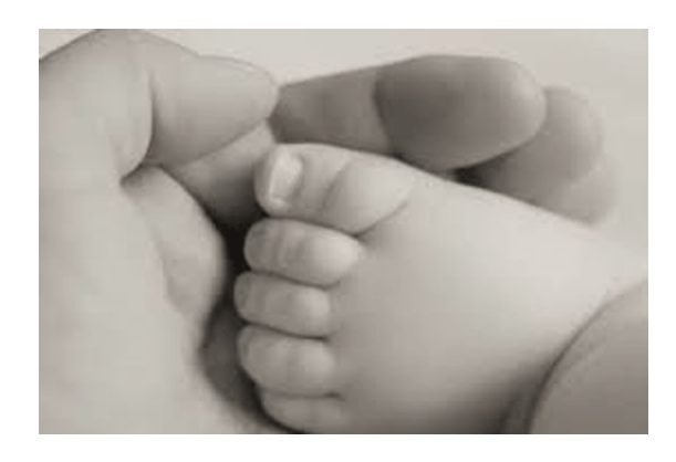
Like the song says, "it's the little things in life. . ."

Now let's take this concept to its logical conclusion. You can built an entire interesting composition with just part of a figure. This newborn's foot is cradled by his mom's hand. That comparison really shows the round softness of those pudgy toes. Best of all, when you've got a great composition, color might actually be less effective than the purity of a black and white image. Imagine the impact of this scene in a big format, maybe 30 x 40 inches! The strong value contracts provide enough contrast to successfully pull off a larger format.