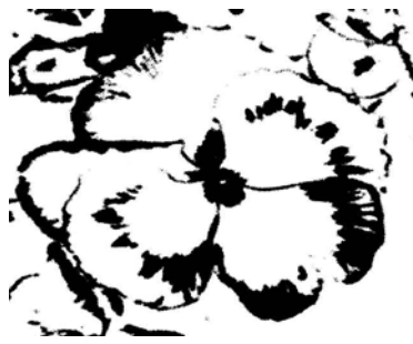
Figure 3 Back of Figure 2 above

In Figure 3 above, I've just turned the tracing over so I'm looking at the reversed image. Then take a regular pencil and just use the side of the lead to mark where the shapes are. This is shown in pink below in Figure 4 . As you can see, it doesn't take a lot to identify where lines go and graphite won't show up as aggressively as if you used traditional carbon paper to transfer the image.