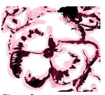
Figure 5 Tracing right side up

Now turn the tracing paper right side up as shown in Figure 5 below. Put it on your watercolor paper or canvas. Use your pencil to trace over the edges. This will transfer a small amount of the graphite on the back to your final surface!