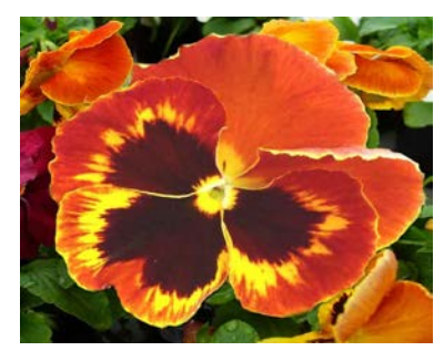
Figure 1 Original photo

2. Is it okay to use a tracing of my own photographs? Some subjects are so complex that you'll need a detailed drawing to follow. In her book <u>Painting Close-Focus Flowers in</u> <u>Watercolor</u>, North Light Books, 2000, Ann Pember, takes her own photographs of individual flowers that each have dozens of petals. She then uses a variety of methods to enlarge and transfer a detailed image. If you're a stickler for exact detail, use a projector to create the appropriate size image on a your blank watercolor or tracing paper that is taped to the wall.