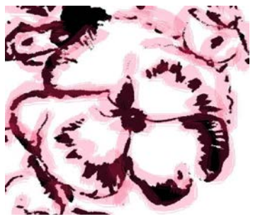
Figure 4 Graphite over the back of the tracing

In Figure 3 above, I've just turned the tracing over so I'm looking at the reversed image. Then take a regular pencil and just use the side of the lead to mark where the shapes are. This is shown in pink below in Figure 4 . As you can see, it doesn't take a lot to identify where lines go and graphite won't show up as aggressively as if you used traditional carbon paper to transfer the image.