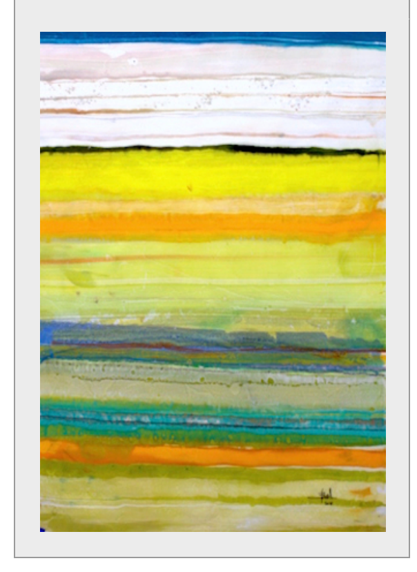
"Varadero" 36"X 24" Encaustic Monotype on wood panel

October 1st to November 30th Reception Friday October 2nd, 6:00 to 7:00PM