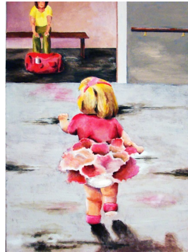
Run to Mama

A great way to show movement in art is painting people on the move. Toddlers are the best because they are always slightly off-balance, and hence the "toddle". Having one arm up and the other out to the side adds to the oblique lines of the torso. In Run to Mama (below), our little ballerina also has that pudgy baby fat that helps indicate her age. She is moving so fast that the breeze lifts her tutu gives us a peek at her diaper.