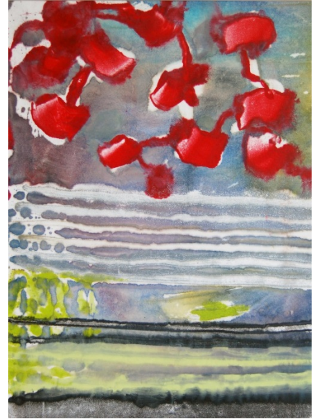
Format: Lecture and demonstrations

We will experiment with several types of papers and scrolls. Introduce new tools (mark making), stamps, soft lead pencils, charcoal, rubber tipped tools, stencils, plastic grid material, bubble wrap in a variety of sizes, soft kitchen utensils, scrapers, clay-modeling tools, etc. We will do additive and subtractive processes, and try various tools and plate temperatures in order to become comfortable with the many possibilities. All this with plenty of time to paint after every presentation.