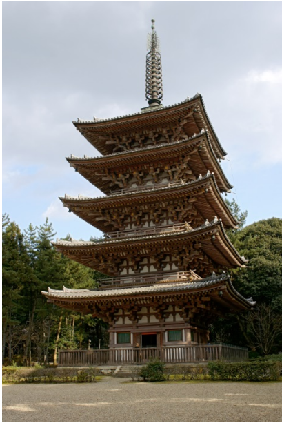
The Daigoji Five Story Pagoda built in Kyoto, Japan in 1348 AD.