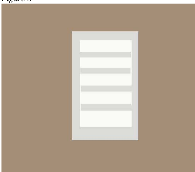
Figure 8 above is a part of a composition of a room in a house. With Figure 9 below, the boring pattern of the window blinds is broken up. There's not enough detail to really tell what's out there, but it makes that portion of the painting interesting!