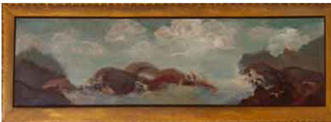
Safe Harbor Acrylic on canvas By Penny Krit

And if you feel like showing off, use a trompe l'oeil technique. In that case, you paint both the outer edges of the front of the canvas and the sides of the canvas to look like a frame.