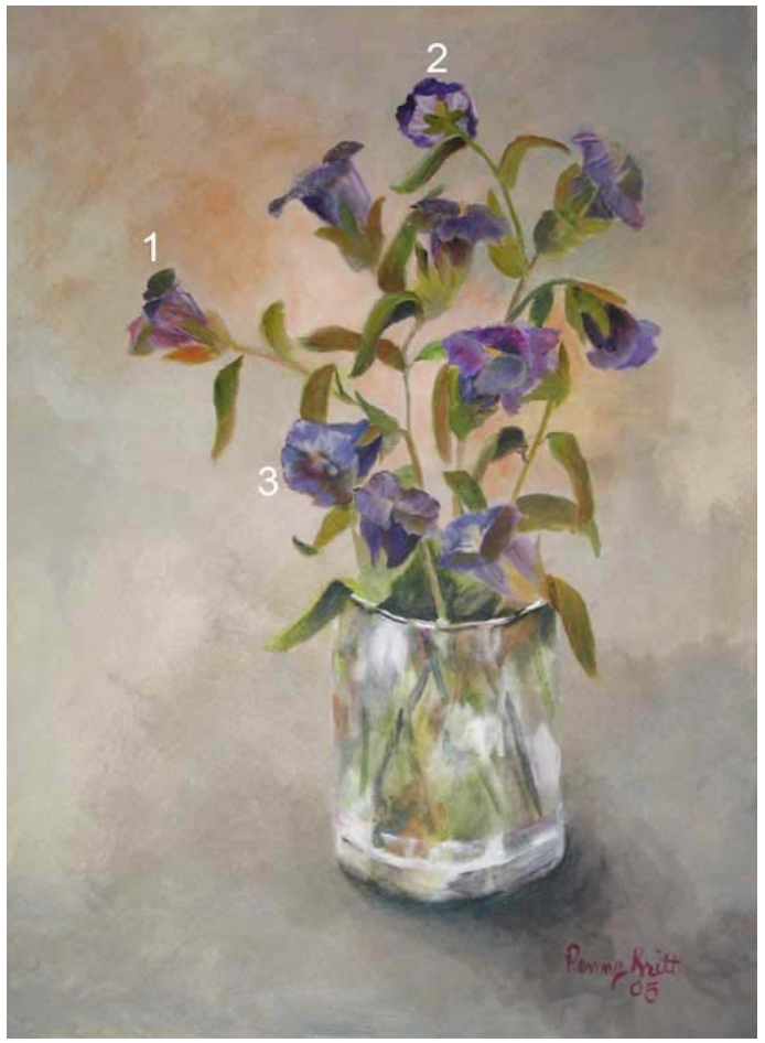
Campanulas in Gray By Penny Kritt

In the painting below, the floral arrangement is painted so you see the side (1), the back (2) and inside (3) of a campanula. It would be boring if all the flowers were painted from the same angle. Think outside the box!