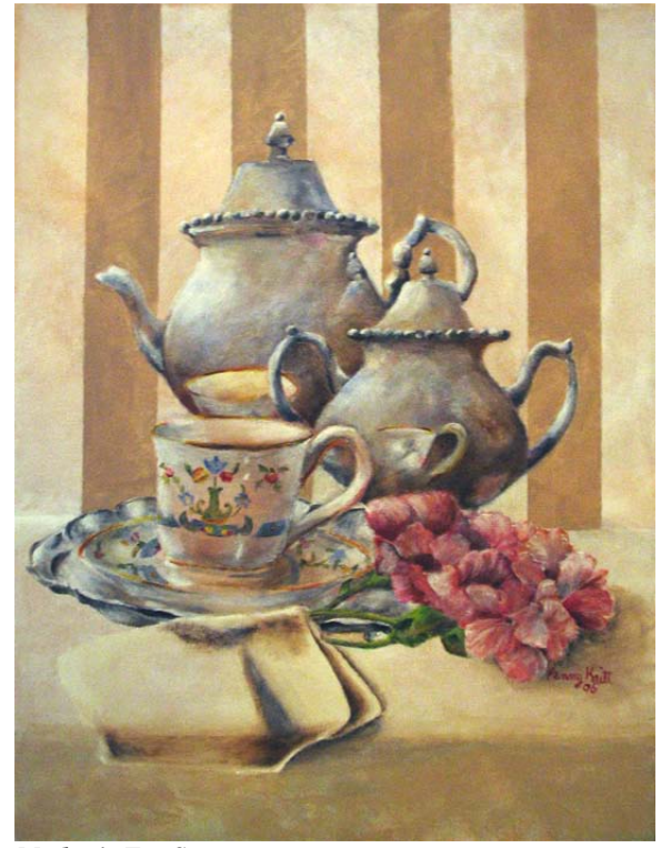
Mother's Tea Set By Penny Kritt

How about trying to paint metal? Use Daniel Smith quinacridone burnt orange and French ultramarine blue to get all the colors of silver or chrome. By varying the mixture, you can get anywhere from gun metal blue to milk chocolate brown. When I want to paint something that makes me happy, I paint my mother's silver teapot.